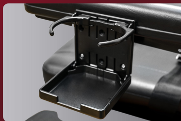
Personalize your Go-Go® with one or more of our optional accessories.