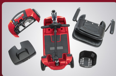
Feather-touch disassembly for quick transport or storage.