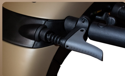
Tiller adjustment lever