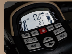
User friendly console

18.5" x 16.5" Limited recline, black vinyl, high-back seat with lumbar and pillow-top headrest, flip-up height and angle-adjustable armrests