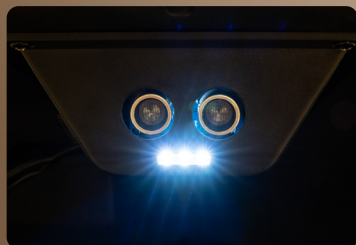
Backup sensors with LED light

Pride's CTS Suspension includes adjustable shocks for greater comfort